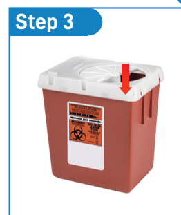
Step 3 Collect blood sample and discard the device into sharps container