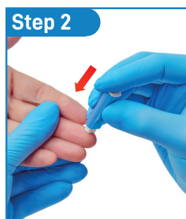
Step 2 Press against test site to activate the device